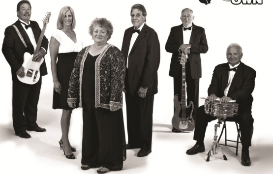
"LOUISVILLE'S OWN BAND"